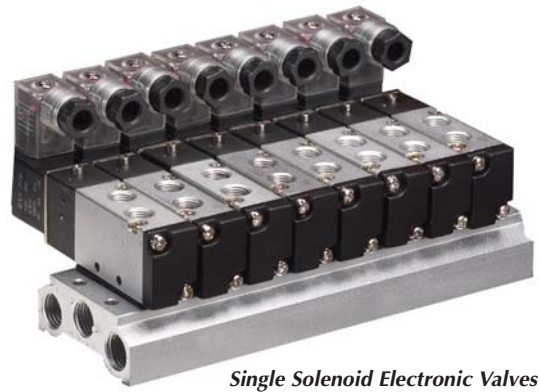
Single Solenoid Electronic Valves Mounted on 8-Station Manifold

This numbering schematic is shown for illustration purposes only. All possible configurations are not available. For standard models, see the products illustrated in this catalog.